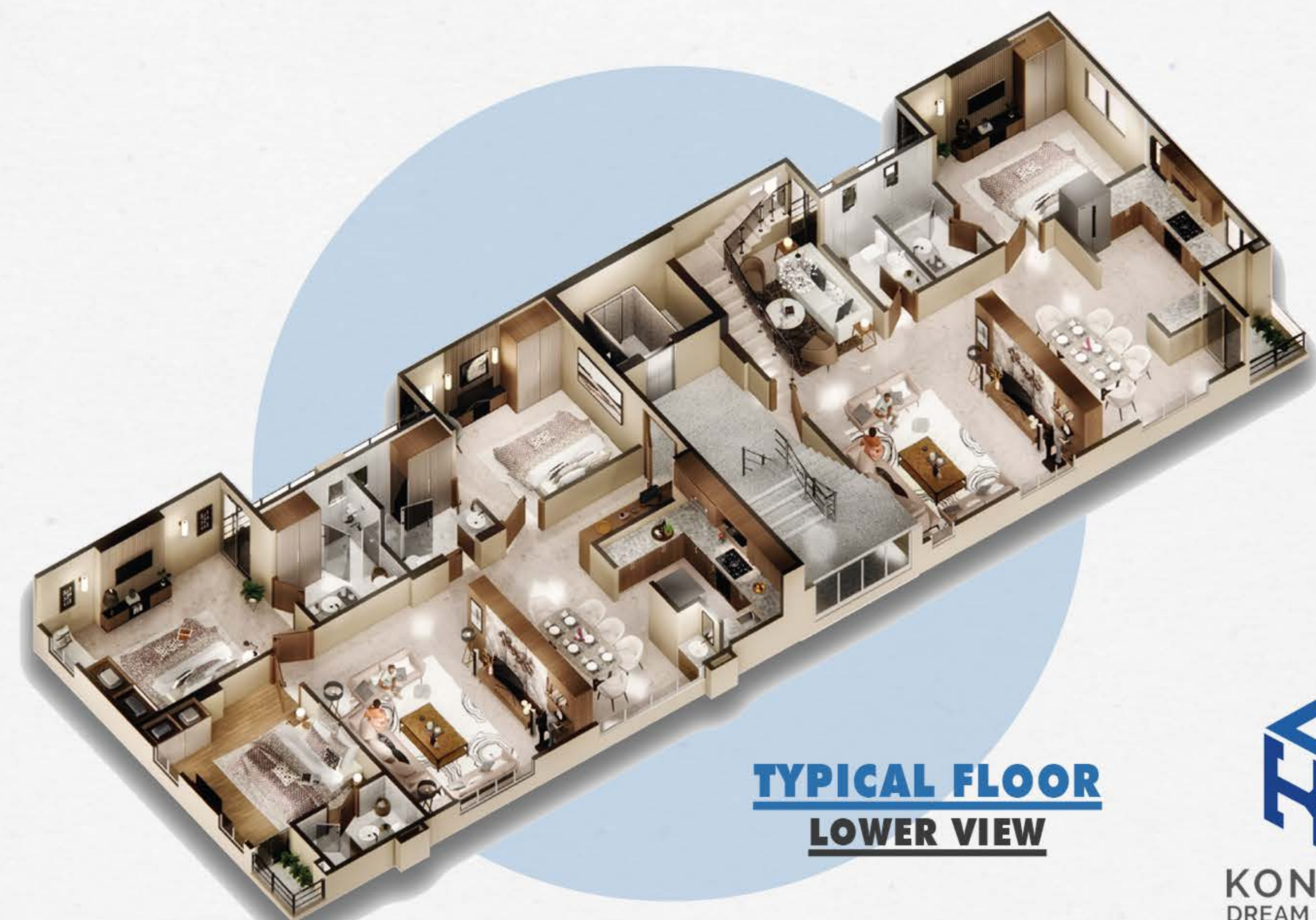
TYPICAL FLOOR LOWER VIEW